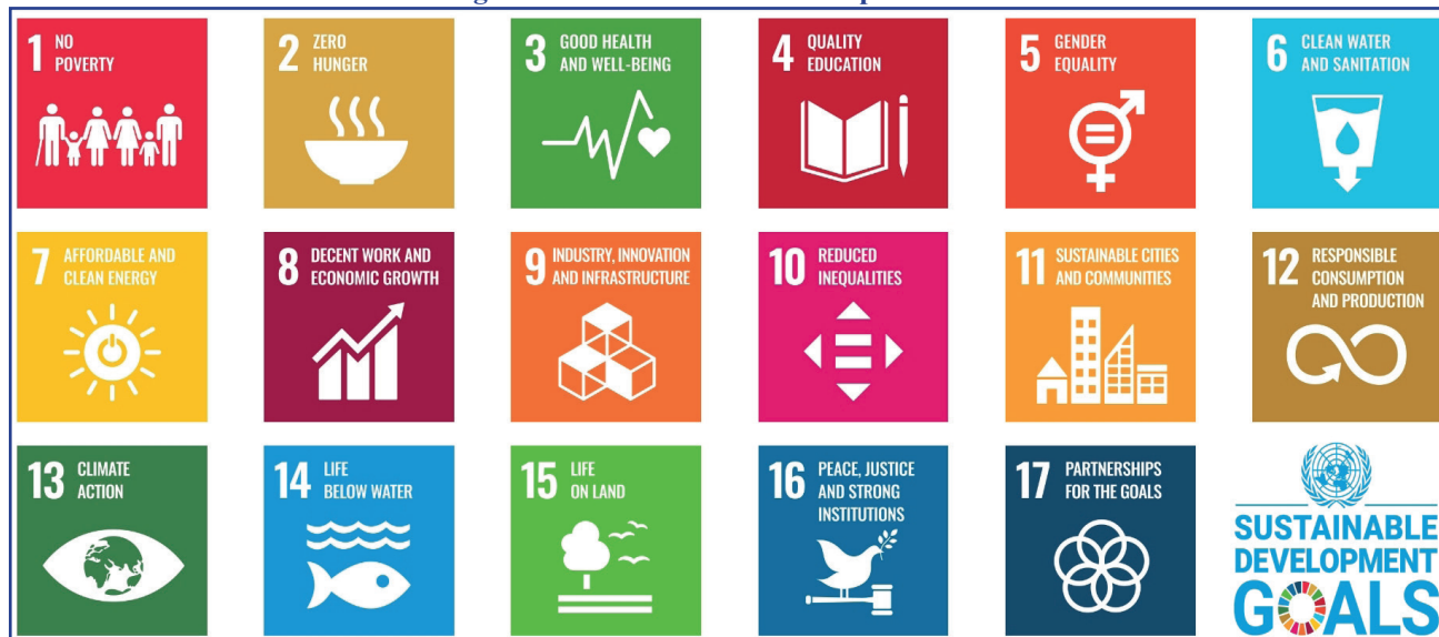
Figure 2: UN Sustainable Development Goals

https://www.un.org/sustainabledevelopment/sustainable-development-goals/