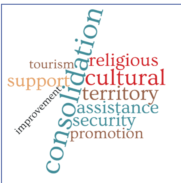
Figure 1: Words Most Used by Respondents in Interviews

Municipalities tend to indicate as objectives the improvement of road safety, the promotion and interpretation of the territory in its various cultural, religious, and natural dimensions through networking