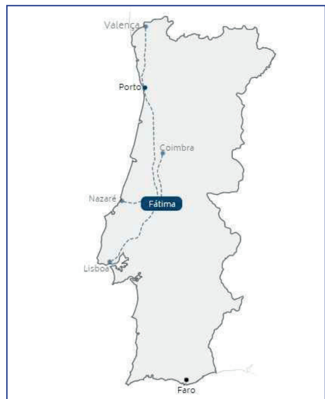
Map 1: Fatima Paths in Portugal

As such, the main objective of this study is to understand the contribution of Marian paths to the sustainable local development of the territories they pass through. Based on the Fátima paths (Map 1), namely the 'Caminho do Tejo' (143 km), 'Caminho da Nazaré' (50 km), 'Caminho