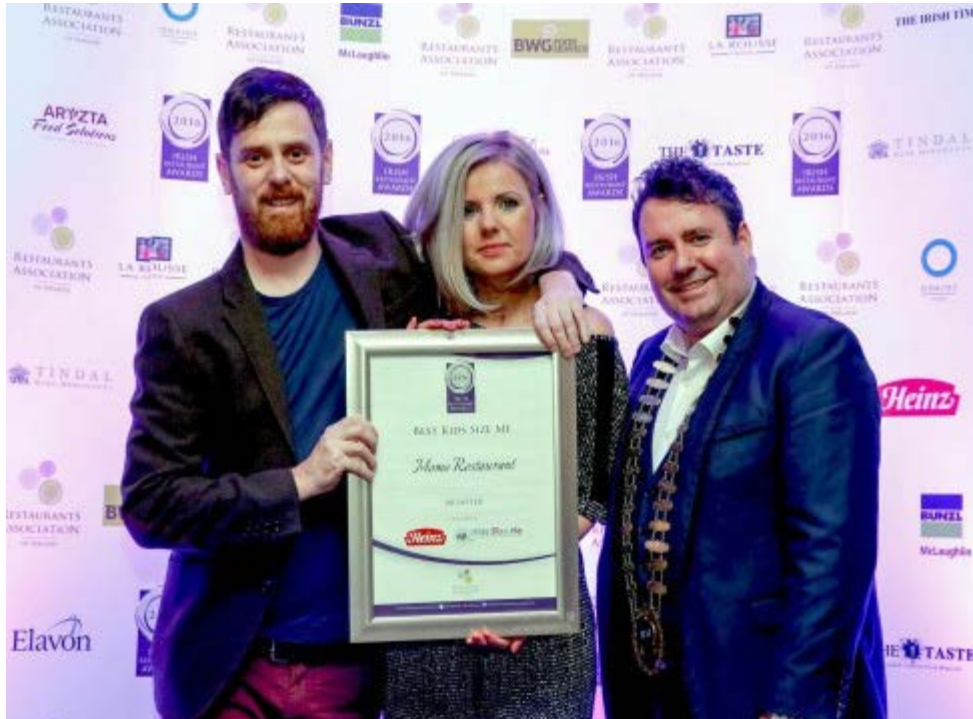
Momo Kids Menu

Winners of "Best Kids Size Me" in Munster 2015, and All Ireland winners in 2016.