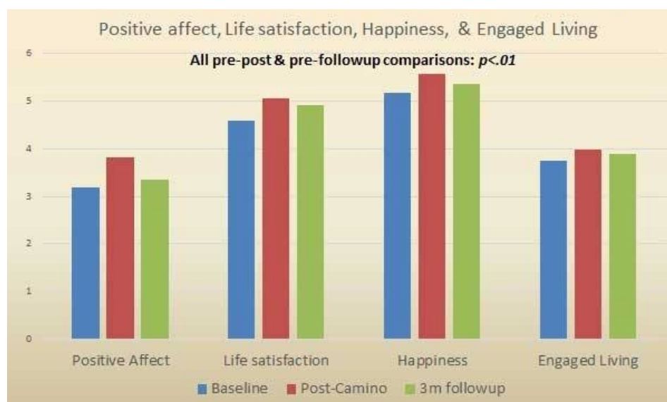
Figure 1: Positive Changes Through the Camino (Baseline, Post- and 3 month follow-up measures (n=107))