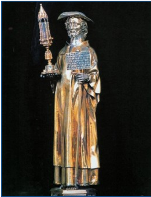
Gothic statuette of St. James the Pilgrim with a tooth of St. James (the Younger?) presented by Gaufridus Coquatrix.

The inscription reads ‘In hoc vase auri quod tenet ista imago / est dens b[eat]i iacobi / Ap[osto]li que Gaufridus Coquatrix ci-/vis par[isiensis] dedit huic ec-/clesie orate pro eo.’ (‘In this golden vessel held up by this statue, is a tooth of St. James the Apostle that Gaufridus Coquatrix, berger of Paris, gave to this church, pray for him.’).