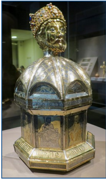
Reliquary of St Oswald, c 1185-89, restored partially 1779