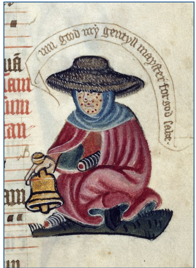
British Library, Pontifical (c.1400), BL Lansdowne MS 451, f. 127. Wikimedia Commons

Medieval pilgrimage was a concentrated exposure to a world of broken limbs and diseased flesh. It was axiomatic in the Middle Ages that the rich had doctors and the poor had pilgrimage, so the stream of travellers struggling to reach their shrines was often a spectacle of suffering that evoked both pity and revulsion. At the entrance to many major towns were hospitals dedicated to Saint Lazarus, charitable leprosaria that isolated travellers who were barred from entering the city. That disease in particular brought a double burden since it had no known cure or treatment and was widely and erroneously presumed to be a venereal infection. A cure through the intervention of a saint – an outcome rarely documented in the Middle Ages – was a leper's only hope. [13]