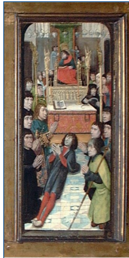
Miracles of St. James, Master of the Legend of St. Godelieve, Flemish, ca. 1500.

Indianapolis Museum of Art, Wikimedia Commons