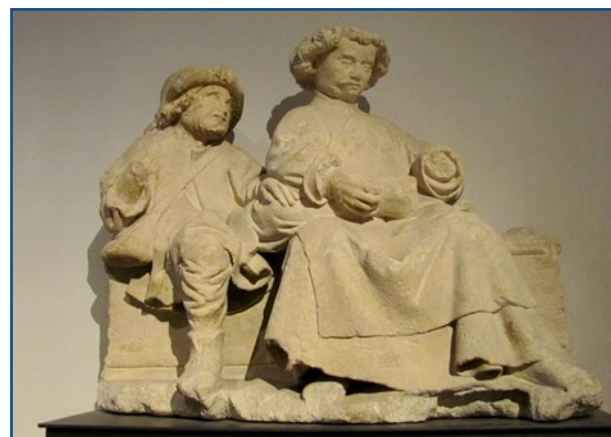
Musée Gadagne, Lyon, France

Modes of travel altered medieval pilgrims' senses of their body in motion. Those who walked to Rome or Santiago – or countless other shrines in Western Europe, tombs and chapels that took them either a few hours away or several years absent from home – felt every step they took. Pilgrims' intimacy with exhaustion, injury, exposure, and hunger would extend to their beasts if they took any, and certainly to the human companions who shared their provisions, apprehensions, illnesses, and lice. [2] A common tongue was hardly guaranteed, although Western Christendom could fall back on the universality of Latin in all