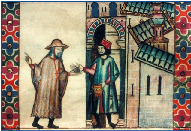
Cantigas de Santa Maria of Alfonso X el Sabio (1221-1284), Códice Rico, Cantiga 144, panel b

Because of social constraints and the dangers of travel, medieval pilgrims were overwhelmingly male, yet the women of that period who did make sacred journeys shared all of the bodily experiences described in these pages. There were some stark differences in the heightened risks of attack and not unrelated vulnerability to charges of sexual disrepute women endured. One curious aspect of the pilgrim's body before the law (and of canon law in particular) was the traveller's 'degendered' state: