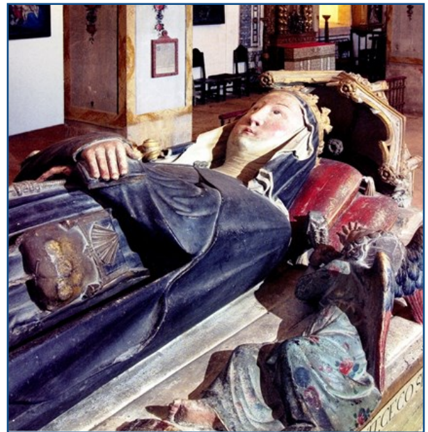
Tomb of St. Isabel of Portugal dressed as a Pilgrim in the New Convent of St. Claire, Coimbra.

human fragments of bone which have never been displayed to the public, while the reputed hand of St. James kept in Reading, England is mummified, a halfway stage between corrupt and incorrupt.