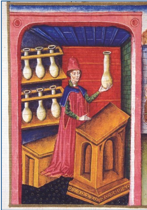
BN-Paris MS 36, f. 97v, ca. 1472. A diagnostician holds a matula, a flask for examining urine samples from his patients.