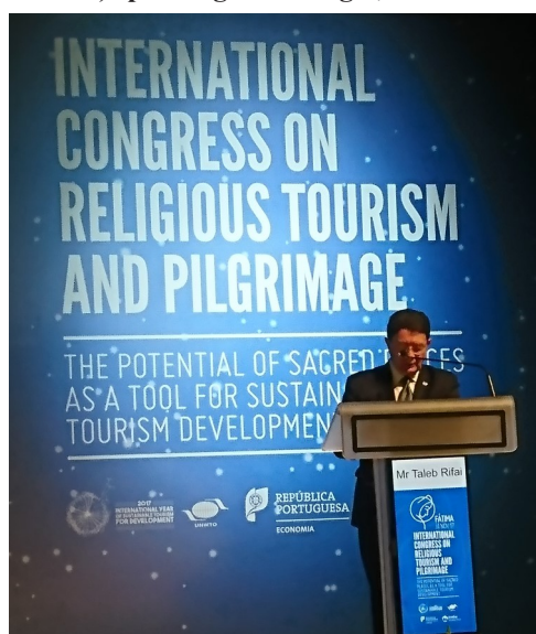
Figure 2 : UNWTO recognition for Religious Tourism and Pilgrimage - Mr Taleb Rifai (Secretary General, UNWTO) speaking in Portugal, November 2017

As can be seen in the discussion above, Religious Tourism and Pilgrimage are substantial motives for the global movement of people. Whether this travel is for purely religious motives, or whether pilgrimage is influenced by some secular desires, or even if the journey is undertaken for entirely profane motives is not being discussed in this reflection. The main issue being highlighted here is the breadth and intensity of this form of religion-linked travel, which goes largely