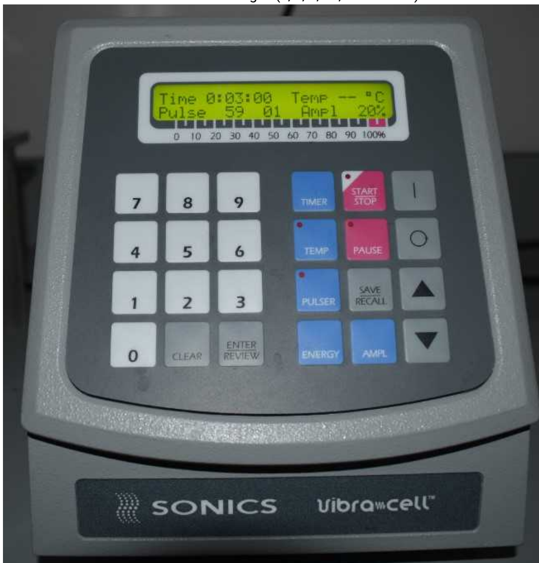
Data processor unit showing the experiment parameters