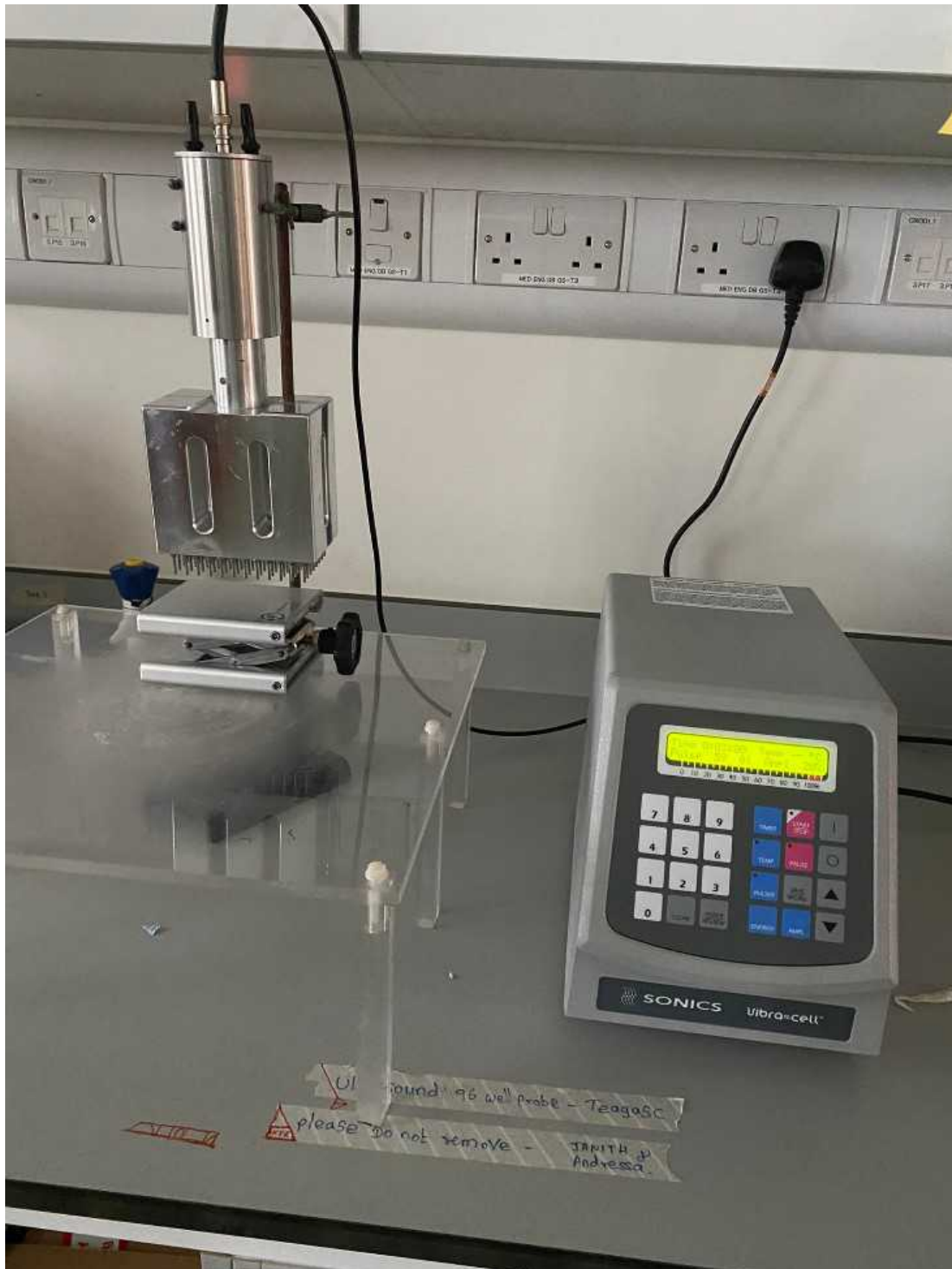
Image of the VCX 750 ultrasonic liquid processor

The 96-probe system is designed to fit perfectly into the 96 well plate, which can be used to grow and treat cancer cells. The retort stand is used to hold the Ultrasound 96 probe unit vertically. A laboratory Jack is used to hold the cancer cells grown in the 96 well plate and to move it towards the 96 probes.