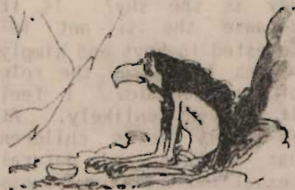
'Waiting For Grant'

Fri. 29th Jan. Climbing Club C23 1.30 pm 'Twig' Fellowship and Biblical Research and Teaching Service C22 1.10 pm