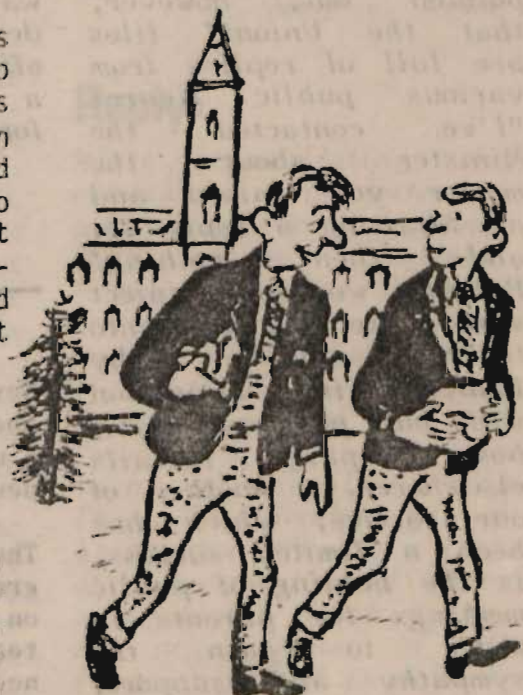
"Dad says I'll have to work hard if I want to get a soft job."