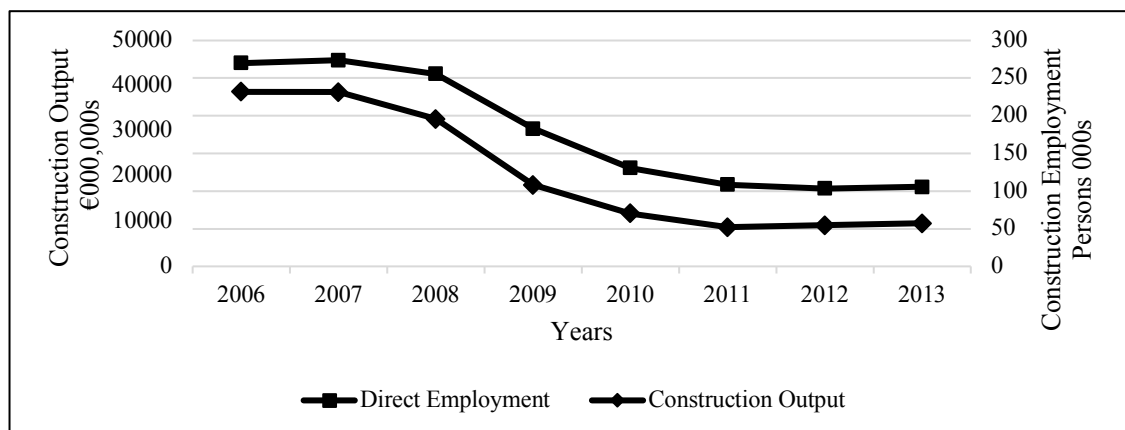
Figure 1: Correlation between changes in construction employment and construction output (SCSI, 2014) (DKM, 2016)

In 2008, following a decade of unprecedented growth, Ireland suffered its most devastating economic downturn in living memory. Much of this economic collapse was due to an over-reliance upon construction by the Irish economy. At its peak, in 2007, construction industry output in Ireland accounted for almost one-quarter of the country's GNP while construction employment accounted for approximately 18 percent of total national employment (DKM, 2016). Construction output had overshot sustainable levels for an economy the size of Ireland's and was twice that of the accepted norm of 10-12 percent of GNP (Forfás, 2013).