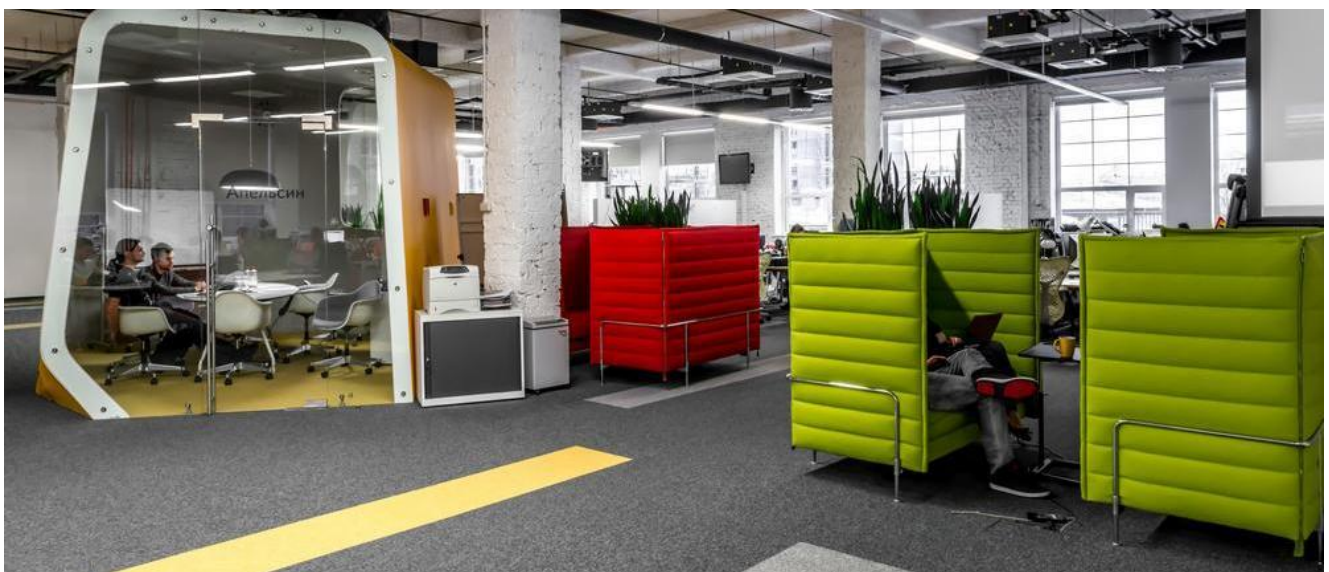
Figure 6: Yandex Stroganov office in Moscow, Russia by Za Bor Architects