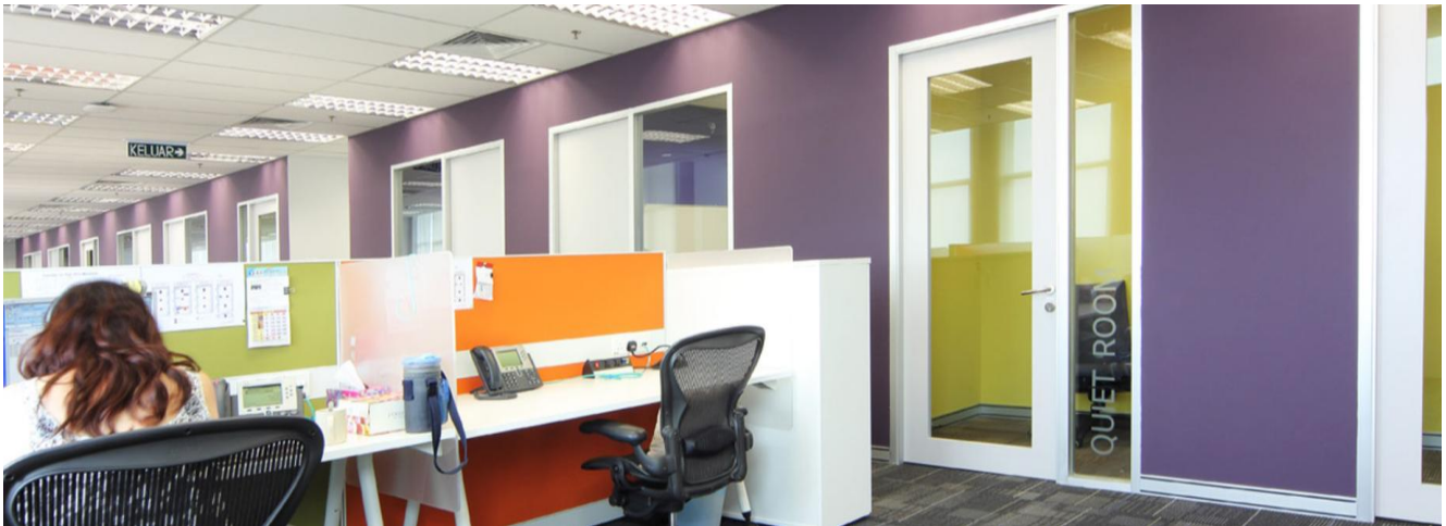
Figure 5: Quite rooms at Cisco, Penang, Malaysia