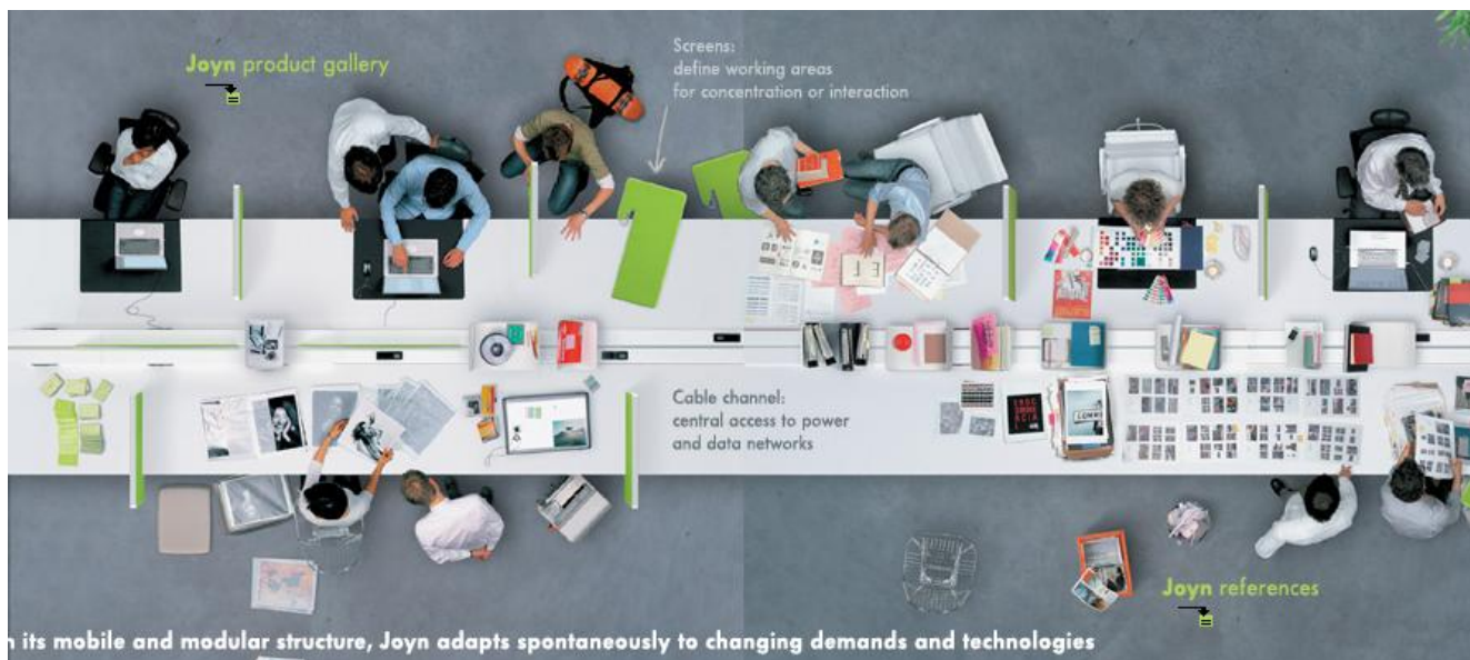
Figure 4: Vitra Joyn, office “Bench” system.

However these solutions were never intended to be standalone and only really work as part of a well-designed scheme where other work modes (Gensler define 4 modes; Collaborate, Focus, Learn, and Socialise) are taken into account and properly catered for.