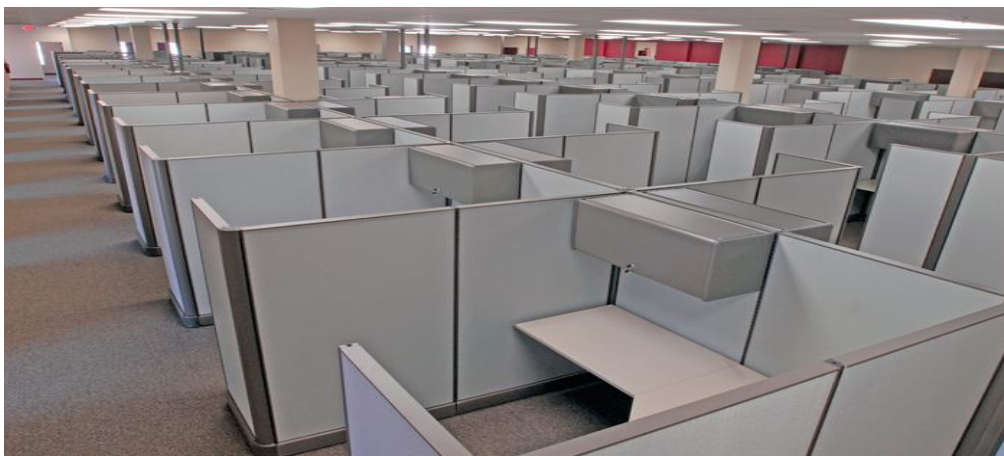
Figure 1: Typical office cubicle system

However, according even to its creator Propst, "The cubicizing of people in modern corporations is monolithic insanity" (Lohr, 1997). The cubicle provided workers with a walled-off personal space, attempting to replicate a cellular office but on a much smaller scale (Figure 1). Cubicle walls, usually at 5ft (150cm) high, were intended to provide both acoustic and visual privacy, but in practice many workers felt more self-conscious as they knew they were surrounded and could be overheard by others but couldn't actually see them. From an information/knowledge flow point of view, the cubicle did nothing to improve workplace communication, with workers now required to phone (or later email) colleagues who they had no visibility of but who may only be a couple of "cubes" or aisles away. According to Francis Duffy, founder of DEGW, an architectural practice specialising in workplace design, cubicles, often referred to as "pig-pens", were a poor compromise describing them as "a disease, a pathology of the office.... It doesn't give you privacy, it doesn't give you control over your environment" (Kremer, 2013).