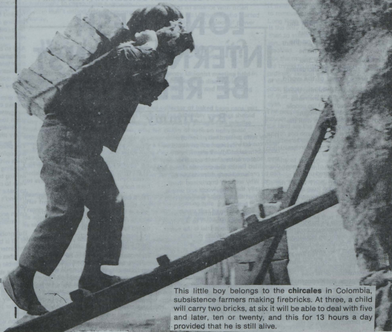
This little boy belongs to the chircales in Colombia, subsistence farmers making firebricks. At three, a child will carry two bricks, at six it will be able to deal with five and later, ten or twenty, and this for 13 hours a day provided that he is still alive.

This meant very little to America but it meant all to Cuba because she was totally dependent on America for the sale of her sugar crop. By refusing to buy Sugar America thought she could bring about the downfall of Castro and the Revolutionary Government.