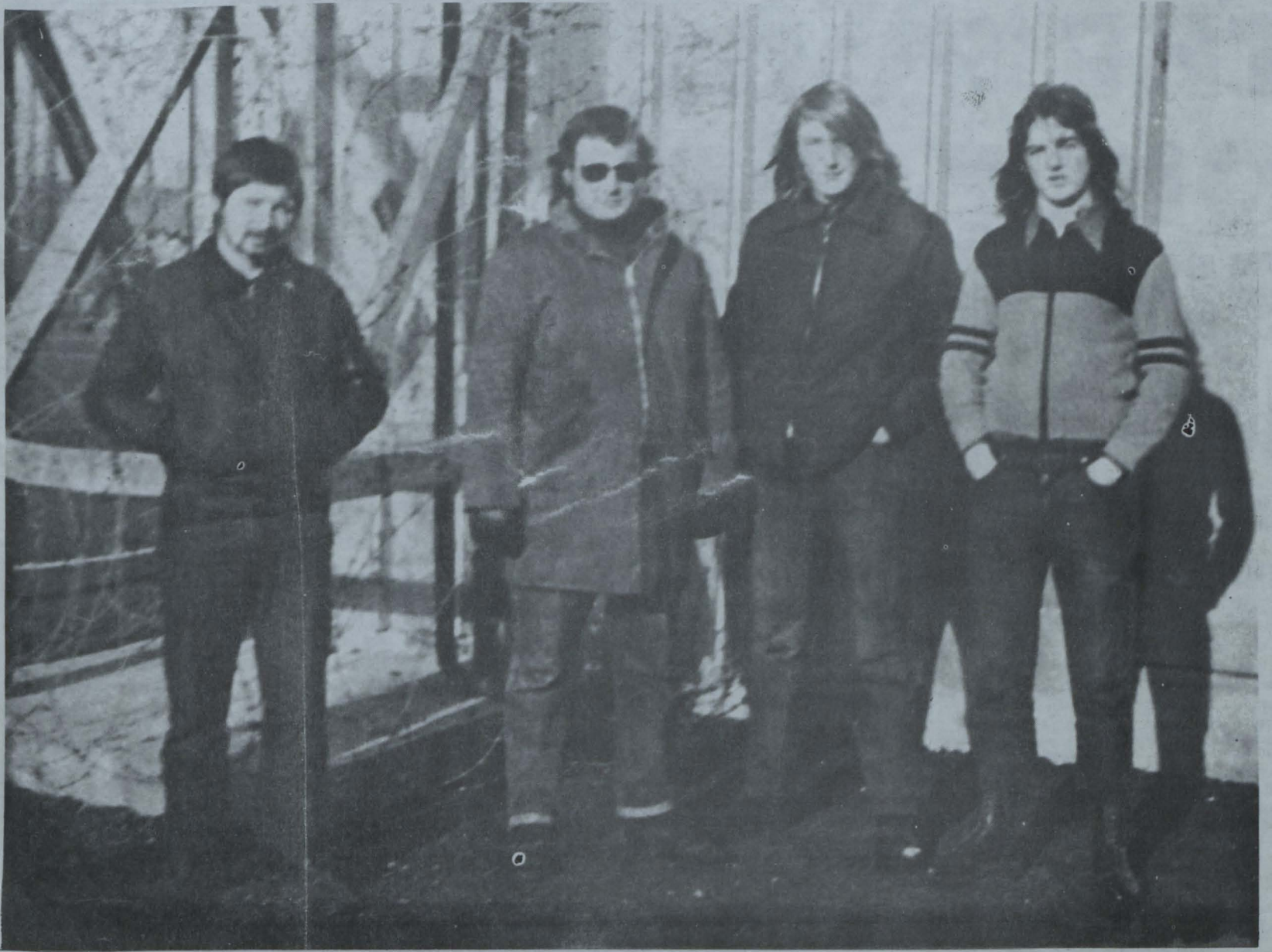
SOME MEMBERS OF THE OFFICIAL REPUBLICAN MOVEMENT PICTURED IN THE COMPOUND WHERE THEY ARE HELD IN LONG KESH CONCENTRATION CAMP.

The place Long Kesh: Forlorn and desolate stretches its iniquitous wires on a secluded morass on the outskirts of Lisburn. The name Long Kesh unscrupulously and obtrusively stretches its increasing infamy to every corner of the world.