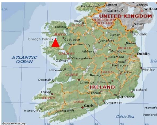
Figure 1: The Location of Croagh Patrick on the Map of the Island of Ireland

Croagh Patrick is Ireland's 800 years old sacred heritage of international repute. It is traditionally known as Ireland's holiest mountain, and an internationally recognised destination for pilgrimage and religious observance for decades. Thus, has been dubbed the Reek. (which is normally the last Sunday in July and the main pilgrimage day). It is equally one of Ireland's most visited touristic attraction. Thus, it serves a dual purpose, simultaneously serving as a place of pilgrimage and tourism. This historic landmark is situated near the town of Westport. This century old mountain is approximately 764m above the sea levels, and it's about 8 km from the city of Westport, 92 km from Galway city and 230 km from the Dublin city centre. It sits above the cities of Murrisk and Lecanvey. The holy mountain boasts of over 1 million visitors who climb it annually. However, these numbers skyrocket especially during the reek Sunday, with visitor numbers reaching a threshold of 25.000. However, it is the increasingly deteriorating conditions of the mountain that led to the formation of a stakeholder group aimed at managing the visitor's experience and impacts, while conserving the sacred natural heritage for future generation consumption.