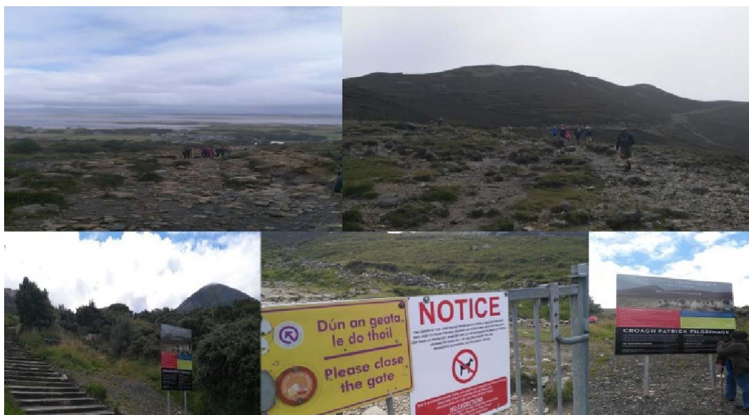
Figure 2: Croagh Patrick Mountain: Photos Depicting the Deteriorating Condition of the Holy Mountain