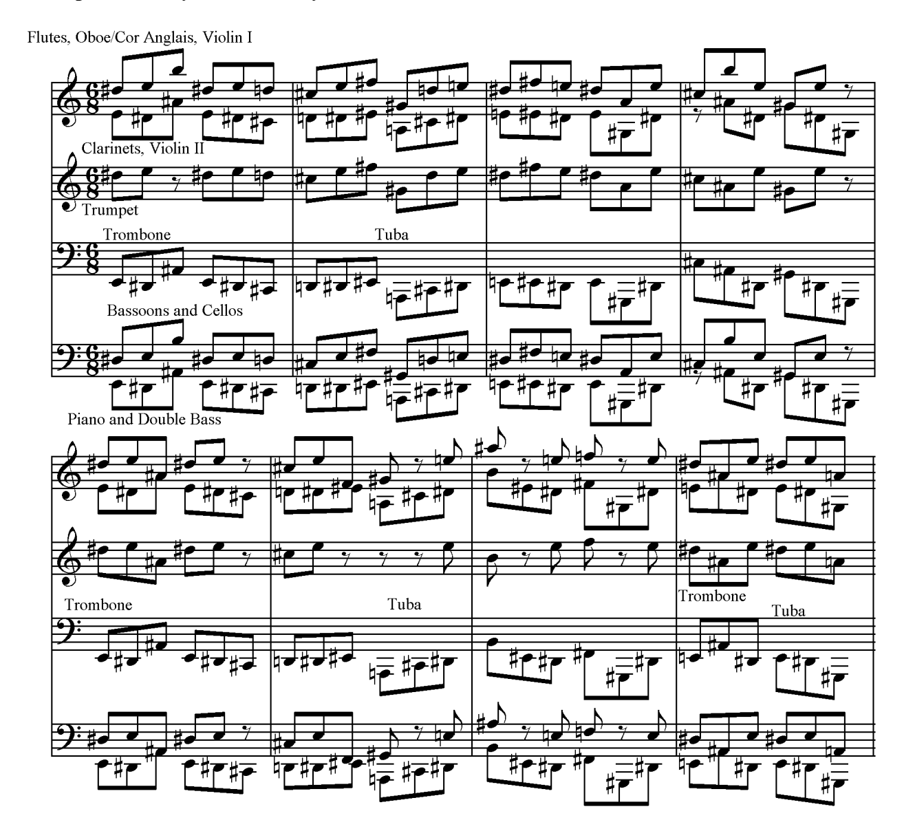
Example 1.2 Barry, Chevaux-de-frise , reduction of bars 247–54

A typical example of this type of writing can be found at bars 247ff where the two-part writing is distributed across the orchestra as follows: