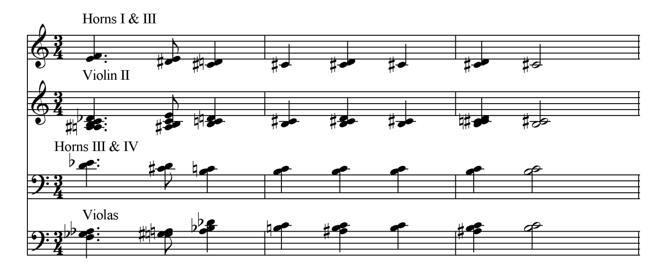
Example 1.9 Barry, Chevaux-de-frise , bars 704ff, variant of prime/inversion