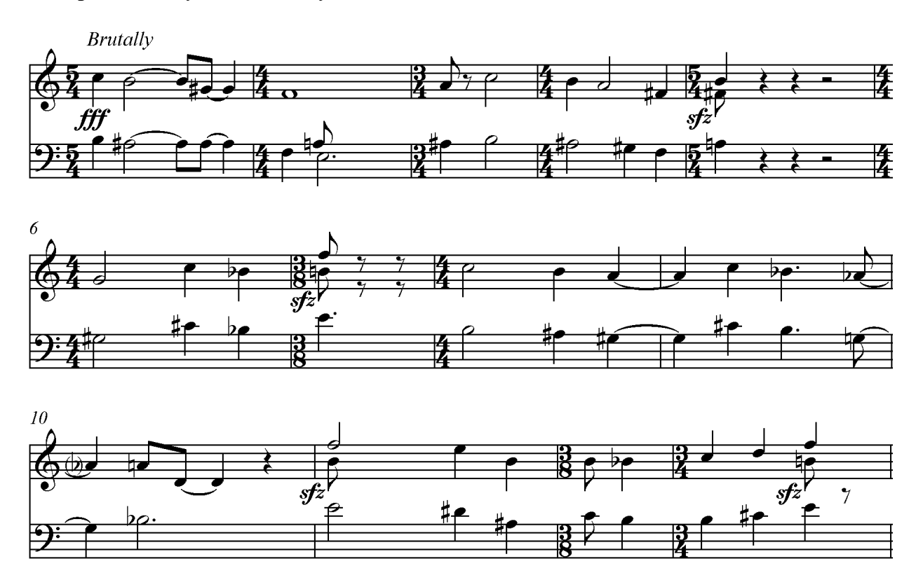
Example 1.6 Barry, Chevaux-de-frise , bars 149–80

It is notable that this statement and the following bassoon duet contain the only silences heard in the piece, in contrast to Barry's earlier work in which silence frequently plays an important role.<sup>27</sup> The next version to appear is a high speed, rhythmically uniform version of the retrograde inversion heard twice starting at bar 494. Once again the material is shifted by one quaver in relation to the barline on its repetition. The inversion, minus its first few notes, follows in similar fashion at bar 532, this entire section acting as a sort of structural upbeat to the large section from 555–731 based entirely on the Mando material.