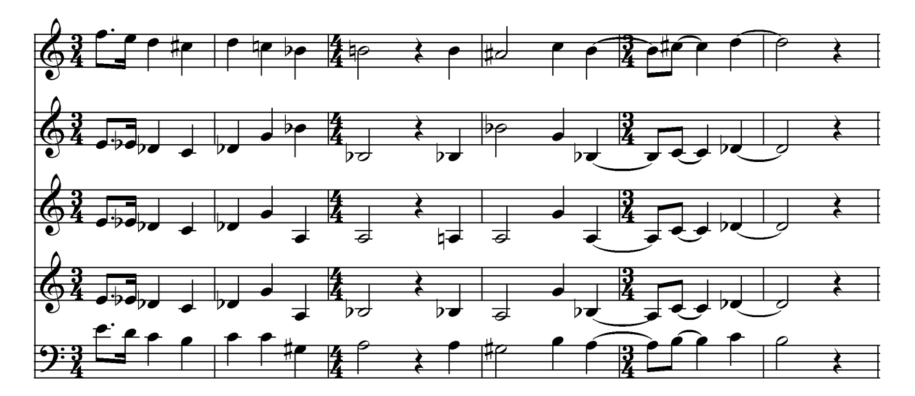
Example 1.8 Barry, Chevaux-de-frise, bars 570–75, variants of the inversion

The statements at 622–48 and 648–75 restore the upper register and there is a greater sense of clarity due, not just to the spacing, but also to the straightforward doubling across the upper parts of the orchestra of the retrograde inversion. The cluster version at bar 676 initially only utilises the retrograde and retrograde inversion, but for the second statement at bar 704, the horns and violas add a severely distorted part which could be technically claimed as the prime, its inversion or a combination of both.