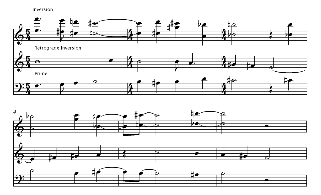
Example 1.7 Barry, Chevaux-de-frise , bars 545–50

This statement is then followed by a series of varied combinations in different registers. The sections at bars 570–95 and 595–621 move to a lower register and combine derivatives of the prime, inversion and retrograde inversion of the theme with the