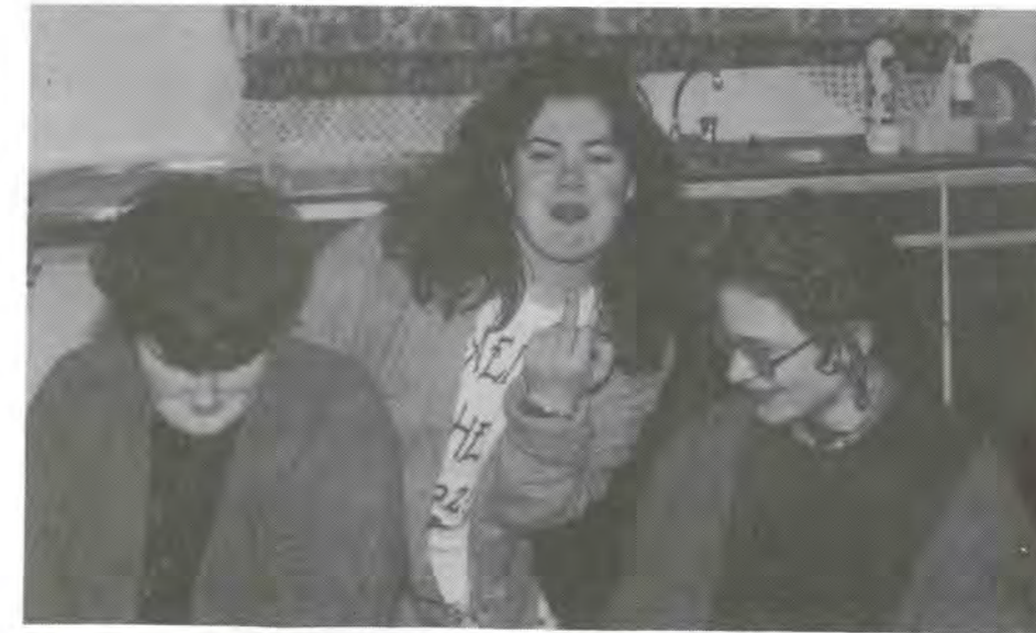
Seachtain na Gaeilge - Page 6

The Wordshop uses the most up-to-date computer hardware and software, including Apple Mac LCs, Pagemaker 4, Word 4 and Superpaint.