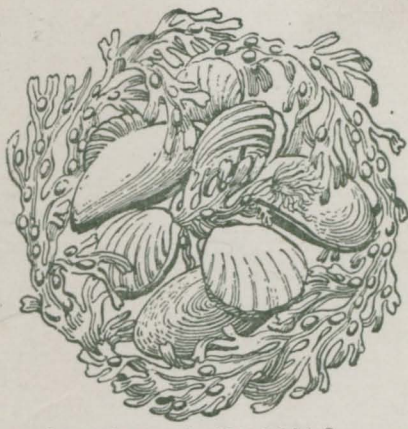
COCKLES & MUSSELS