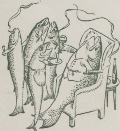
A FISHY STORY