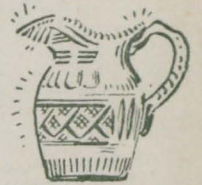
A JUG OF PUNCH