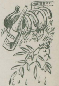
THE GOOD OLD MOUNTAIN DEW