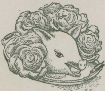
PIGS HEAD & CABBAGE