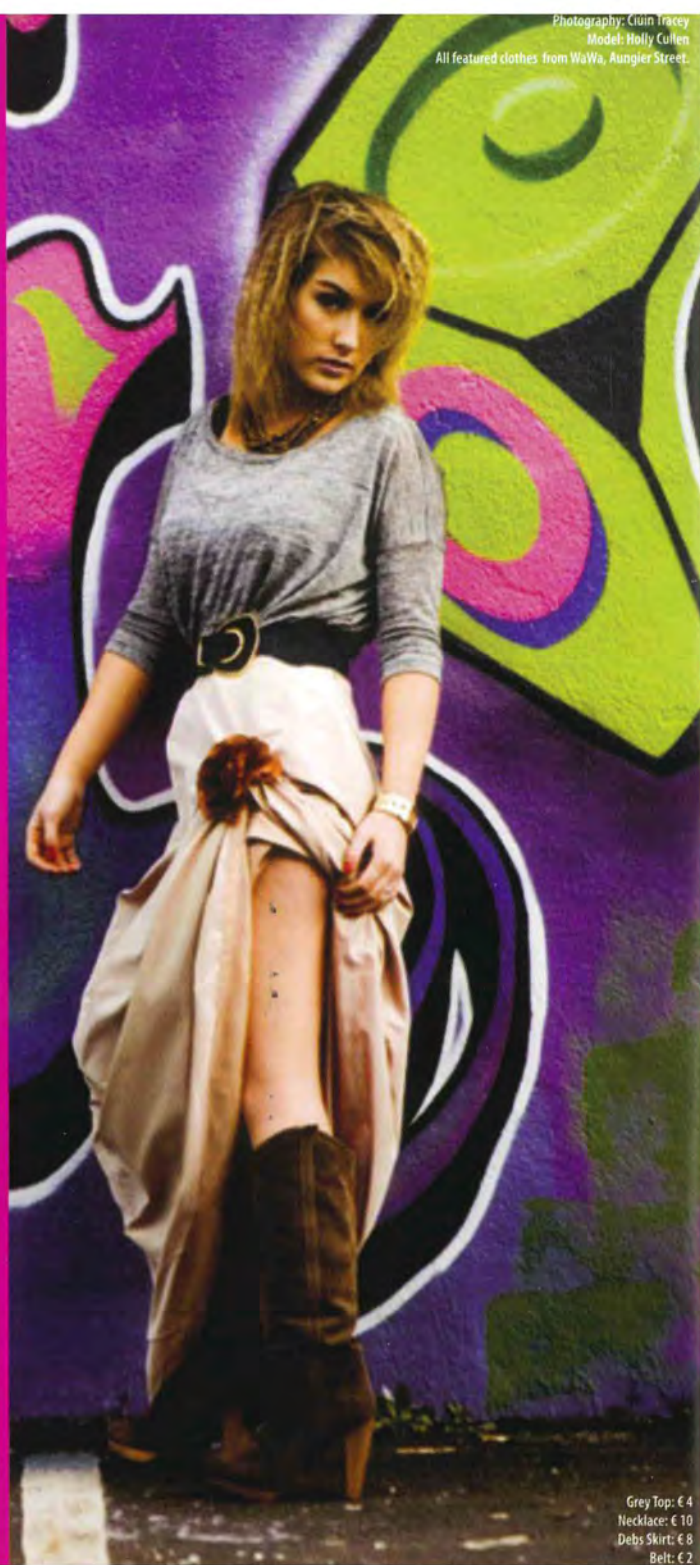
Grey Top: € 4 Necklace: € 10 Debs Skirt: € 8 Belt: € 2

Model: Holly Cullen All featured clothes from WaWa, Aungmyer Street.