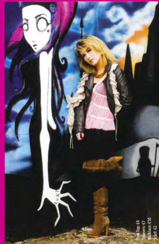
Pink Top: €4 Jousers: €7 Necklace: €10 Scarf: €2 Boots & Coat: Models Own