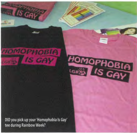
DID you pick up your 'Homophobia Is Gay' tee during Rainbow Week?