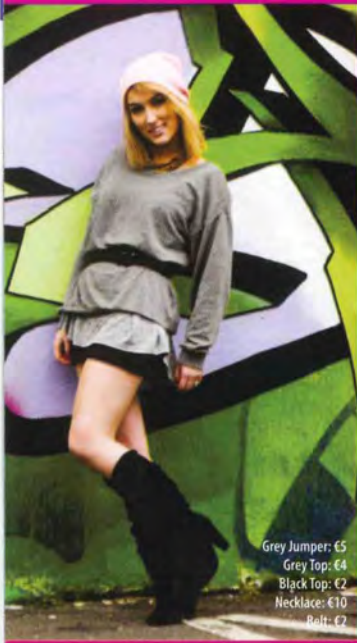
Grey Jumper: €5 Grey Top: €4 Black Top: €2 Necklace: €10 Belt: €2