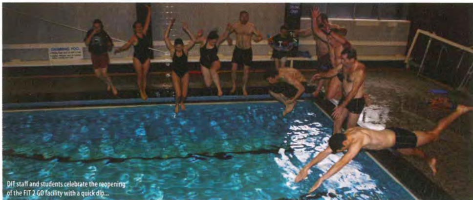
DIT staff and students celebrate the reopening of the FIT 2 GO facility with a quick dip...