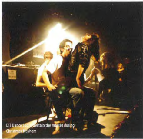
DIT Dance Soc entertain the masses during Christmas Mayhem