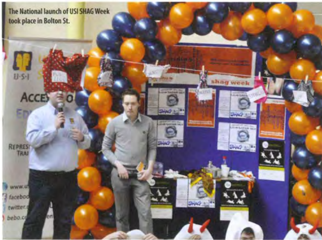
The National launch of USI SHAG Week took place in Bolton St.