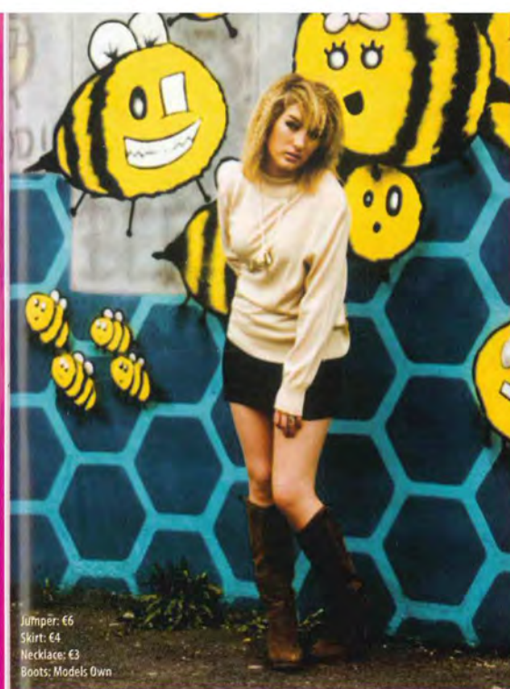
Jumper: €6 Skirt: €4 Necklace: €3 Boots: Models Own