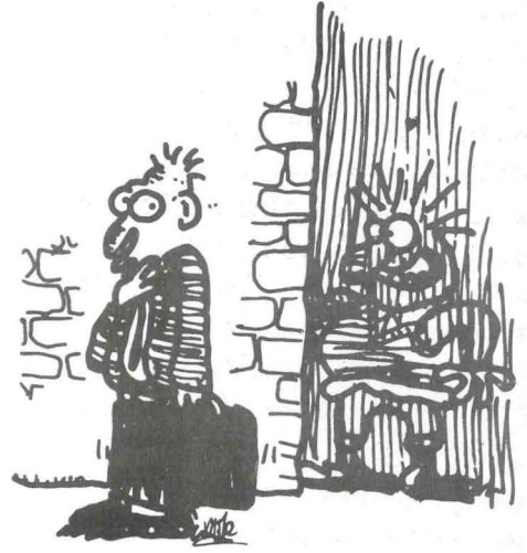
It is a little known yet disturbing fact, that no matter where you may be, at any given time, you are never more than 12 feet away from a prok.