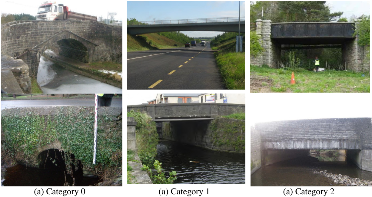
Figure 2 – Samples of the Bridges Examined