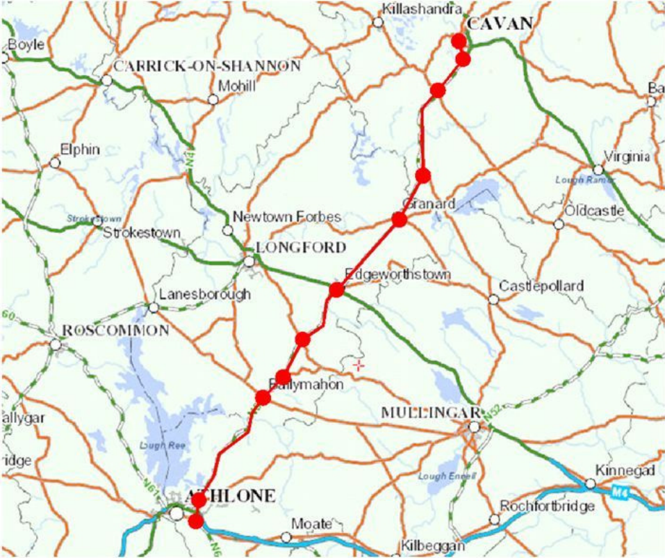
Figure 3 – Hypothetical Route Examined - Route Highlighted and Nodes Shown

Using Equation (1), the probability of this Athlone/Cavan event being captured by the length method is 23.7%.