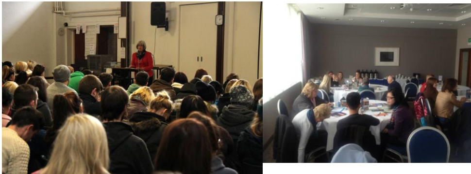
Figure 2.3: Student briefings by key stakeholders in Wexford