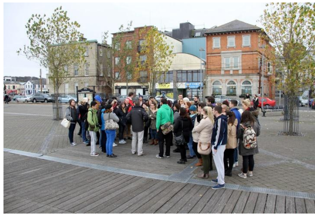
Figure 2.4: Students on a site visit in Wexford