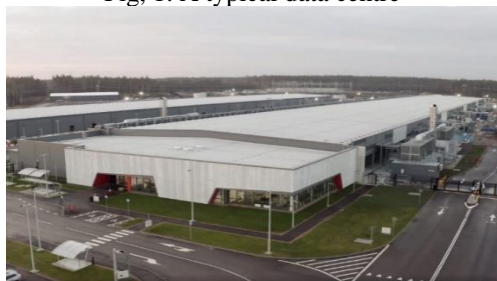
Fig. 1. A typical data centre

The lead investigator, is a part time PhD candidate in the school of Food Science & Environmental in TU Dublin. He is also a qualified safety and electrical engineer with five years experience and employed by the main contractor as an EHSP. He conducted 27 visual inspections using the systematic visual inspection method for the entire site, as described in section 1.2 above. The time taken for the lead investigator's visual inspections varied between one and three hours, dependant on site conditions and activities encountered.