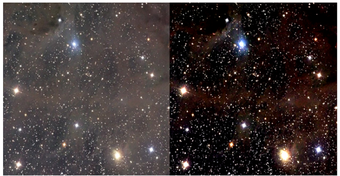
Fig. 3. Fractional diffusion based deconvolution (right) for \sigma_n/\sigma_{I_0} = 1 of a dust clouded star field (left) in the constellation of Pegasus.

We have considered different approaches to modelling light scattering through random media including: formal scattering