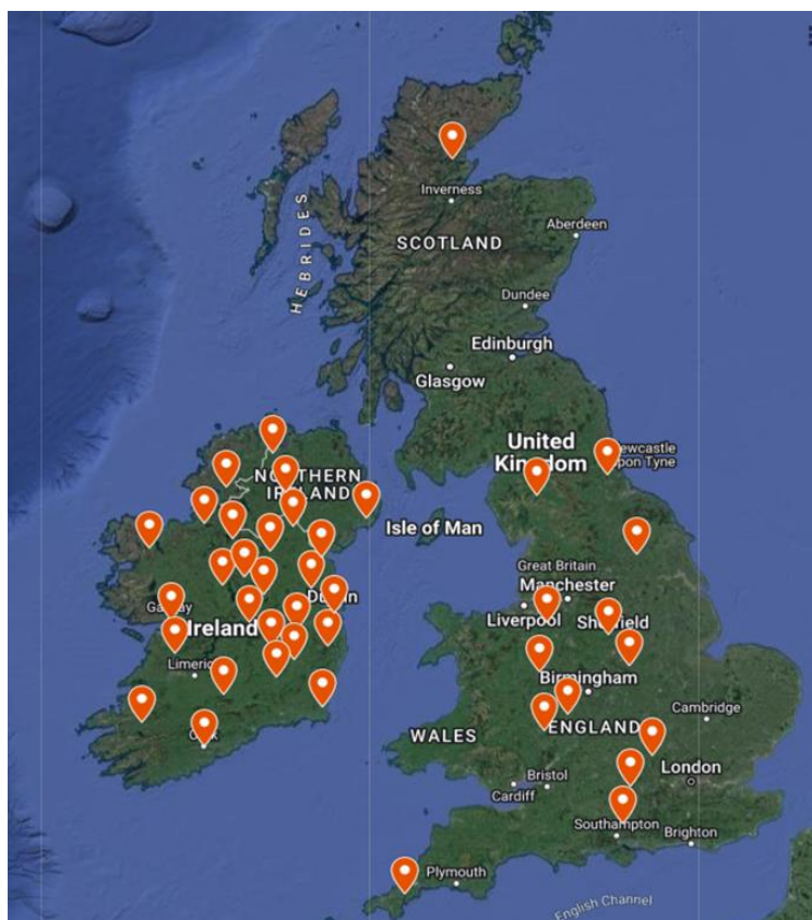
Figure 3.2: Compilation of the counties that the data were gathered from during the survey.