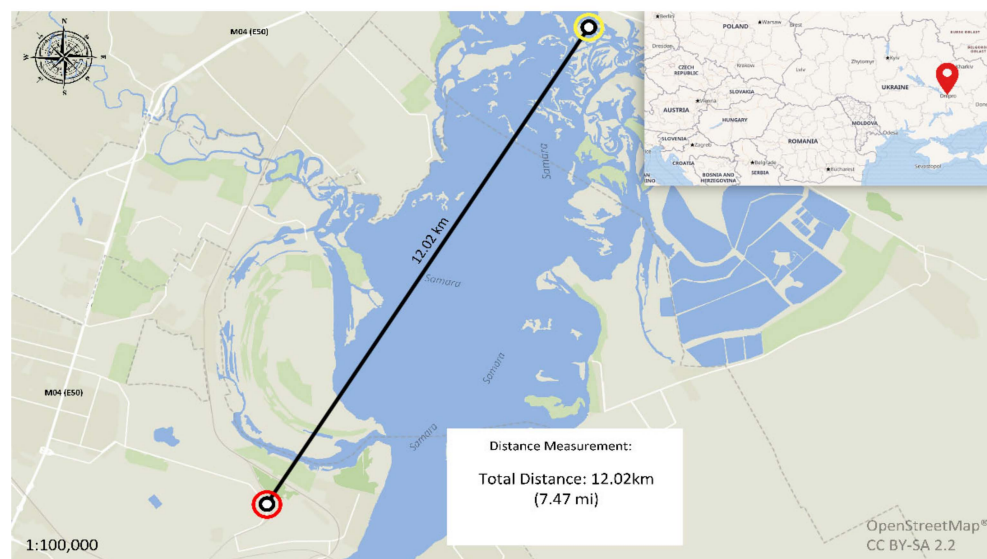
Figure 1. A map of the sampling site. The yellow circle indicates the sample sites; the red circle indicates the enterprise location; the dark line is drawn at a distance of 12,020 m from the source of pollution (enterprise for the production and processing of batteries in Dnipro city in Ukraine) to the sample site. The insert map is a map of Ukraine. The red symbol indicates the city of Dnipro. “CC BY-SA 2.2”.

It should be noted that in the “Northern” industrial zone, which includes the enterprise for the processing of rechargeable batteries and the factory for the production of rechargeable batteries, there was also an enterprise for collecting scrap ferrous and non-ferrous metals. The other enterprise, via the exploitation processing, potentially affected the studied area. In general, the studied territory was transformed due to anthropogenic activity [30]. The research site was located at a distance of 3.3 km from Novomoskovsk Pipe Plant and 50.0 m from the M04 (E50) highway, which may affect the concentration of metals in soil and plants, and thus the results obtained.