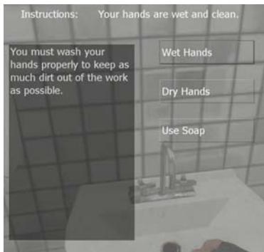
Figure 3: Interaction menu example - A player interacting with a wash hand basin.

Flexibility is again demonstrated in the approach taken in displaying the Heads Up Display (HUD). The HUD itself is derived from elements of the VGUI with Serious Gordon specific HUD elements derived from the HUD classes. Figure 4 presents the HUD from Half Life 2 and compares it with the HUD we developed for Serious Gordon. This approach provides a common look and functionality amongst HUD elements. Although the Serious Gordon elements provide different information, they do not come as a change to a player familiar with the Half Life 2 game.