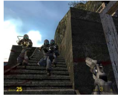
Figure 1: The HUD (Heads Up Display), weapons and non player characters in Half Life 2

Scripting in the Source engine is achieved by implementing modules in C++. Valve provides the full source code for the games Half Life 2 and Counter Strike and consequently modules from these games were adapted for use in Serious Gordon. In some cases changes were simple and involved removing code that instantiated existing features, such as the HEV (Hazardous Environment Suit) suit statistics. Once these features were removed the game was ready for the Serious Gordon assets to be integrated and the code to script the gameplay could be added.