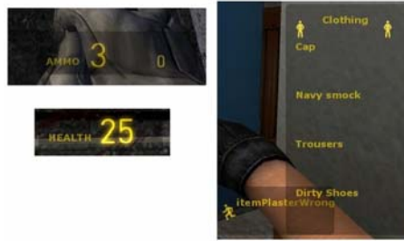
Figure 4: The Half Life 2 HUD (on the left) and the Serious Gordon HUD (on the right)

Flexibility is again demonstrated in the approach taken in displaying the Heads Up Display (HUD). The HUD itself is derived from elements of the VGUI with Serious Gordon specific HUD elements derived from the HUD classes. Figure 4 presents the HUD from Half Life 2 and compares it with the HUD we developed for Serious Gordon. This approach provides a common look and functionality amongst HUD elements. Although the Serious Gordon elements provide different information, they do not come as a change to a player familiar with the Half Life 2 game.