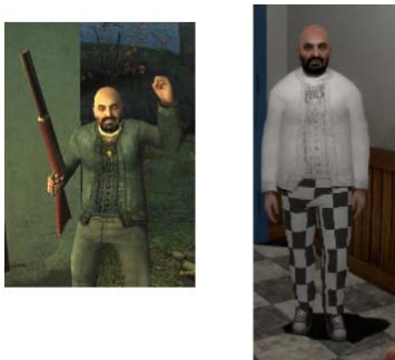
Figure 6: Father Gregory from Half Life 2 (left) and reskinned to make Chef from Serious Gordon (right)

Using the prewritten storyboard, dialogue was scripted for the character voices. These were recorded using the open source audio editing tool Audacity. We engaged the services of a professional voice actor from the Gaeity School of Acting to record the dialogue [Gaeity, 2006]. The actor could reproduce several speaking accents on demand and so provided the voices for several Serious Gordon game characters. The Source engine uses standard WAV files for vocals.