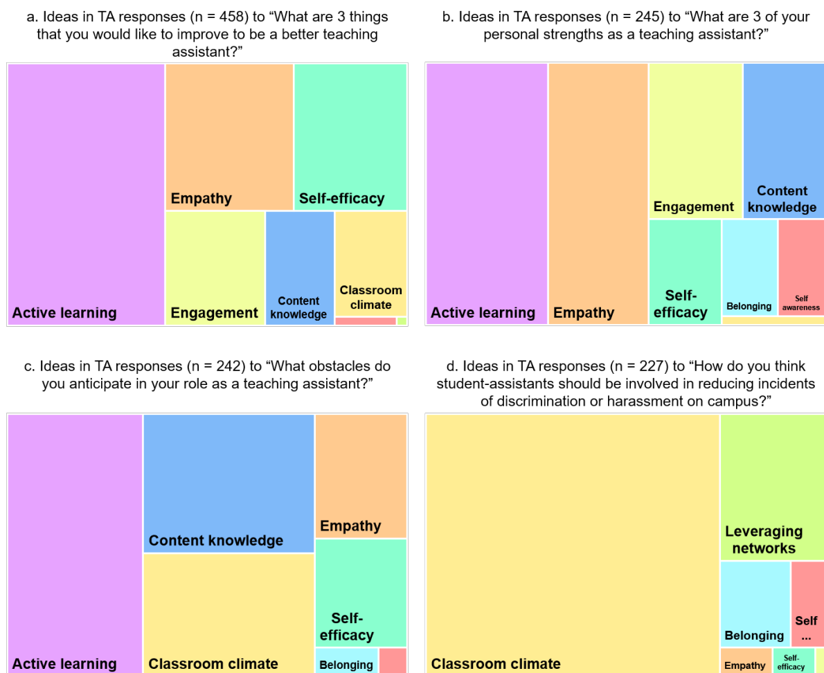
Figure 1. Relative frequency of ideas in TAs' responses grouped by the competencies in the inclusive teaching framework. See Tables 1 + 2 for colour legend.

appear with the same frequency, and differ in their prominence across the four general prompts given to the students. Ideas about pedagogical skills (including active learning and engagement) and empathy for the students featured prominently in their strengths, obstacles they faced, and aspects they need to improve in their roles as TAs (Fig 1 a-c). With respect to active learning and engagement, TAs' responses reflected themes from the training including using questions to guide cognitive tasks, modelling problem solving methods, facilitating group work, interacting with the students and being encouraging. The value of having empathy for the students was expressed through comments about listening to students, and being patient, kind and understanding. Although with lower frequency, TAs' responses also refer to other competencies including self-awareness (i.e. confidence, experience, asking for feedback) and supporting students belonging (being respectful, raising awareness of potential barriers to inclusivity).