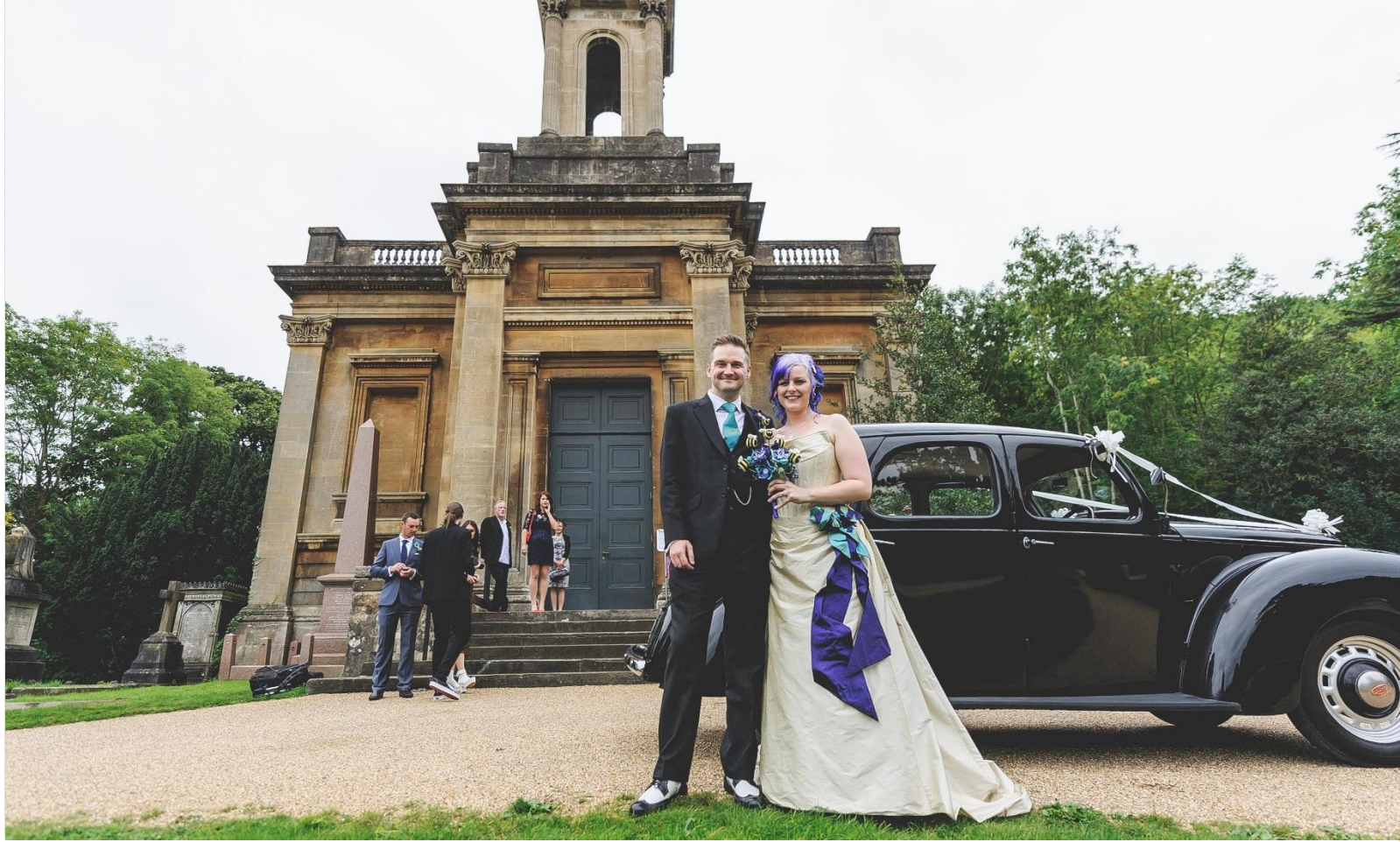
Weddings at Arnos Vale Cemetery, Bristol