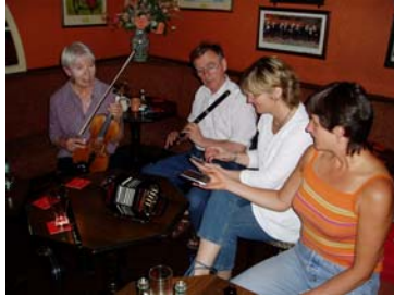
Figure 1: Musicians in a session compare tunes using TunePal

Section 2 of this paper describes the sources that TunePal works with. Section 3 presents the main features of TunePal and gives a brief technical description. Section 4 describes dissemination of TunePal and plans for user validation of the system we have developed. Section 5 presents a summary and conclusions.