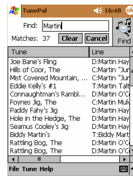
Figure 5: Searching for tunes with TunePal

Playback of tunes is the most essential feature of the program as most traditional musicians learn tunes by ear and not from notes [2]. Initially, the entire tune will be selected and hence played back, though it is possible for a user to select a subsection of a tune for playback. This may be required when learning a difficult phrase for example. TunePal will automatically repeat the selected phrase which further assists learning.