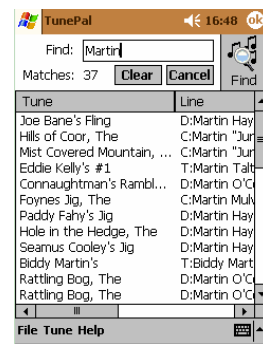
Figure 5: Searching for tunes with TunePal

Playback of tunes is the most essential feature of the program as most traditional musicians learn tunes by ear and not from notes [2]. Initially, the entire tune will be selected and hence played back, though it is possible for a user to select a subsection of a tune for playback. This may be required when learning a difficult phrase for example. TunePal will automatically repeat the selected phrase which further assists learning.