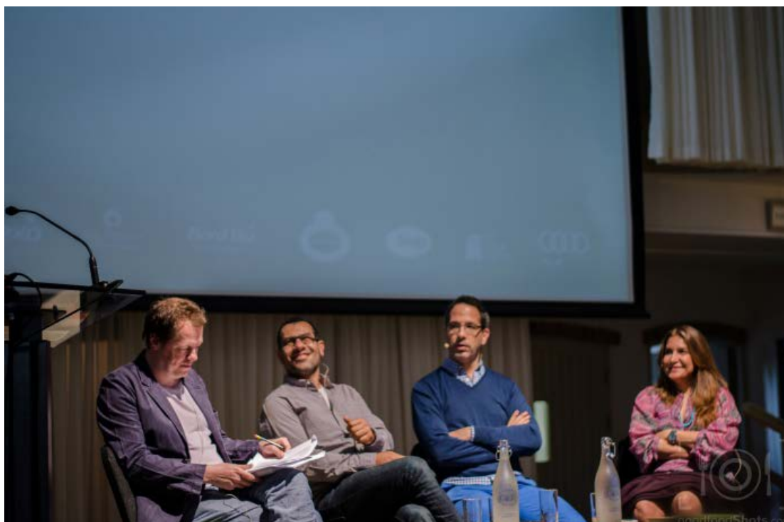
Yotam Ottolenghi, Sami Tamimi and Ariana Bundy

Inspired by Ariana's talk, I came back to Dublin and finally this weekend cooked her amazingly tasty Khoresht Fesenjan, walnut and pomegranate stew with chicken.