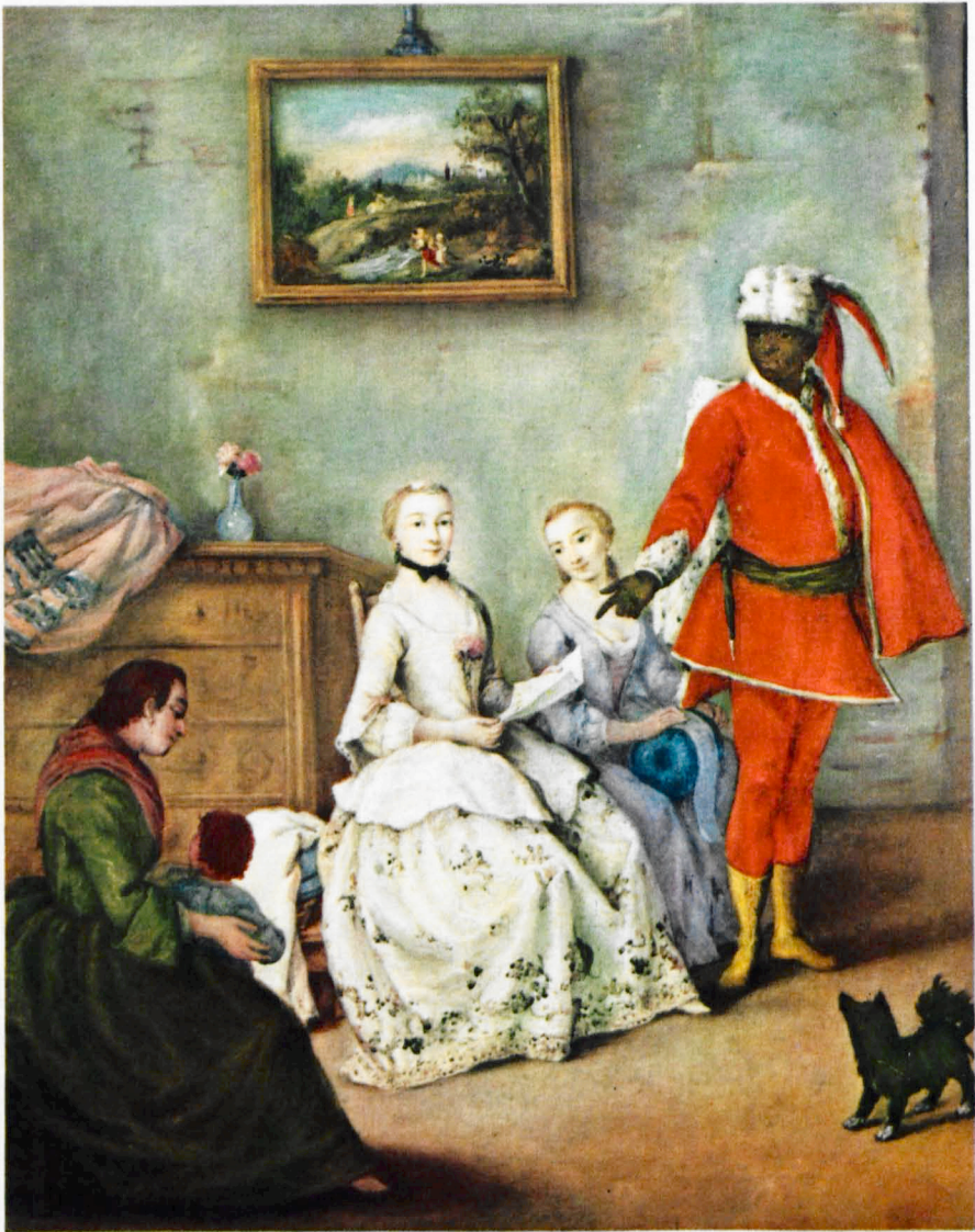
PIETRO LONGHI (1702-1785) - L'ambasciata del Moro - Venezia - Ca' Rezzonico