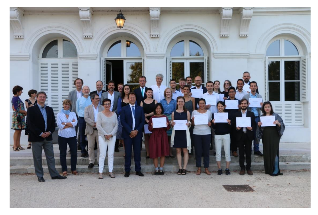
Class of 2018

alternative, non-conventional perspectives and to broaden the regions and cultures studied. May it continue to invest in academic excellence, not neglecting its commitment with the larger society and vigilant concern for contemporary world issues.