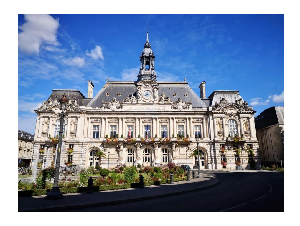
IEHCA Summer University on Food and Drink 2018 Report