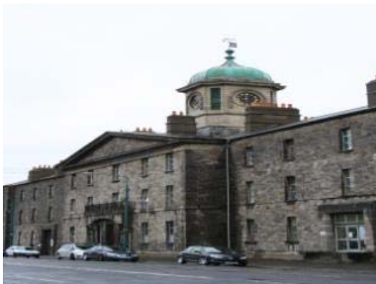
Fig 2: Clocktower Building, Grangegorman

Designed and built in 1816 by the architect Francis Johnston (1760-1829), the building's first function was as the Richmond Penitentiary [11]. Johnston was an architect for the Board of Works (predecessor of the Office of Public works (OPW)) and his work there included the Chapel Royal at Dublin Castle and the General Post Office. Among his other important Dublin buildings are Griffith's Barracks, St Andrew's Church, Royal Hibernian Academy, St George's Church, the former Central Bank in Foster Place and the former Houses of Parliament in College Green.