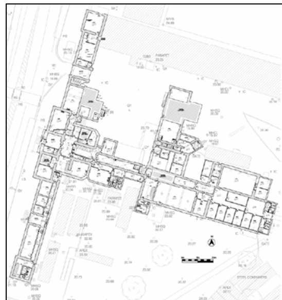
Fig 3: Plan of Grangegorman building demonstrating the layout. To view in large format see [13]

To support the collaborative design work, the programme team were provided with plans, sections and elevations of the building by the Grangegorman Development Agency. However, the team designing the project wished to incorporate a wider range of surveying techniques, particularly, the use of point cloud measurement, to replicate the norms developing in industry.