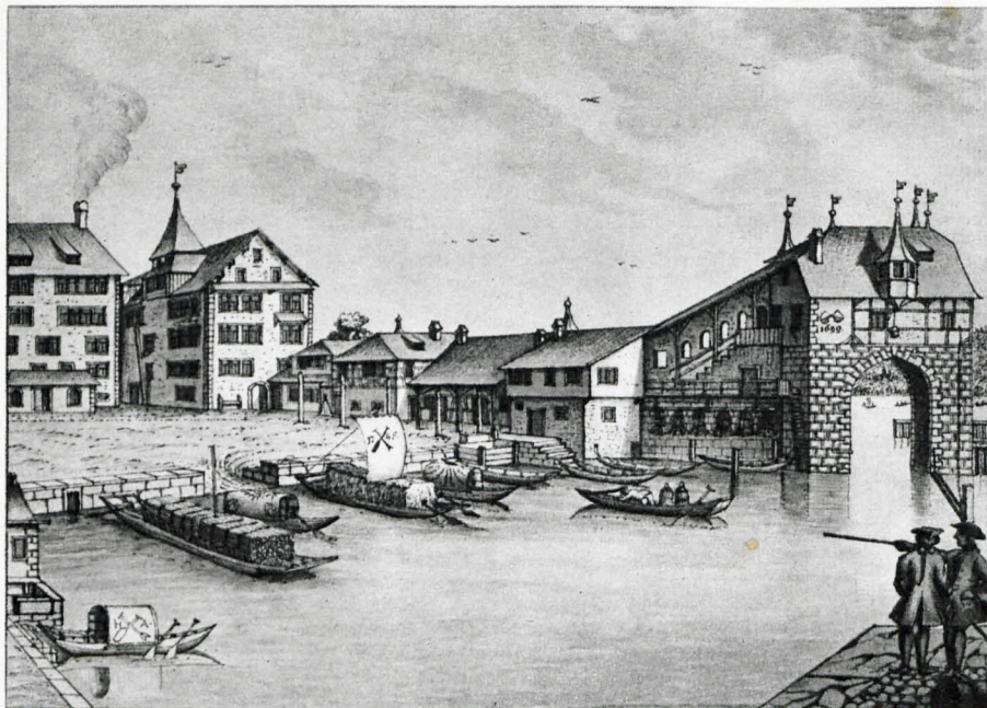
ZÜRICH Grendel mit Schifflande um 1750