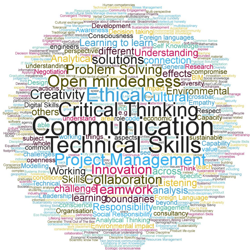
Figure 2: Overall word cloud indicating skills requirements for Engineers to achieve the SDGs [All groups, All countries]

The focus groups were tasked with a brainstorming session which identified a list of skills required to achieve the SDGs. Figure 2 shows the word cloud and list of most frequently used phrases associated with all participant groups and all countries. Further details of skills requirements differentiated by each particular group and country are available in Beagon et al., (2019).