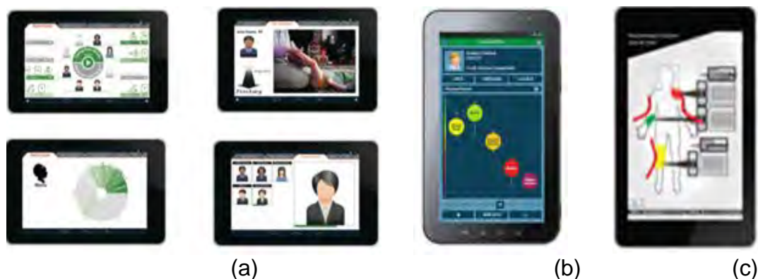
Figure 1: Prototypes designs: (a) Metas da Marta (b) Corpose and (c) Procure

Following our first observational work and preliminary prototype development we returned to the CAIS and led a workshop that reviewed the prototypes and gathered feedback for a second round of design. The second design, entitled the Care and Condition Monitor , was founded on a “care and condition” strategy, which appeared to be valuable to many long-term care contexts, not only that of the CAIS, and could potentially involve families or care recipients. It would enable workers to capture longitudinal data from informal data sources and to visually analyze the condition of residents.