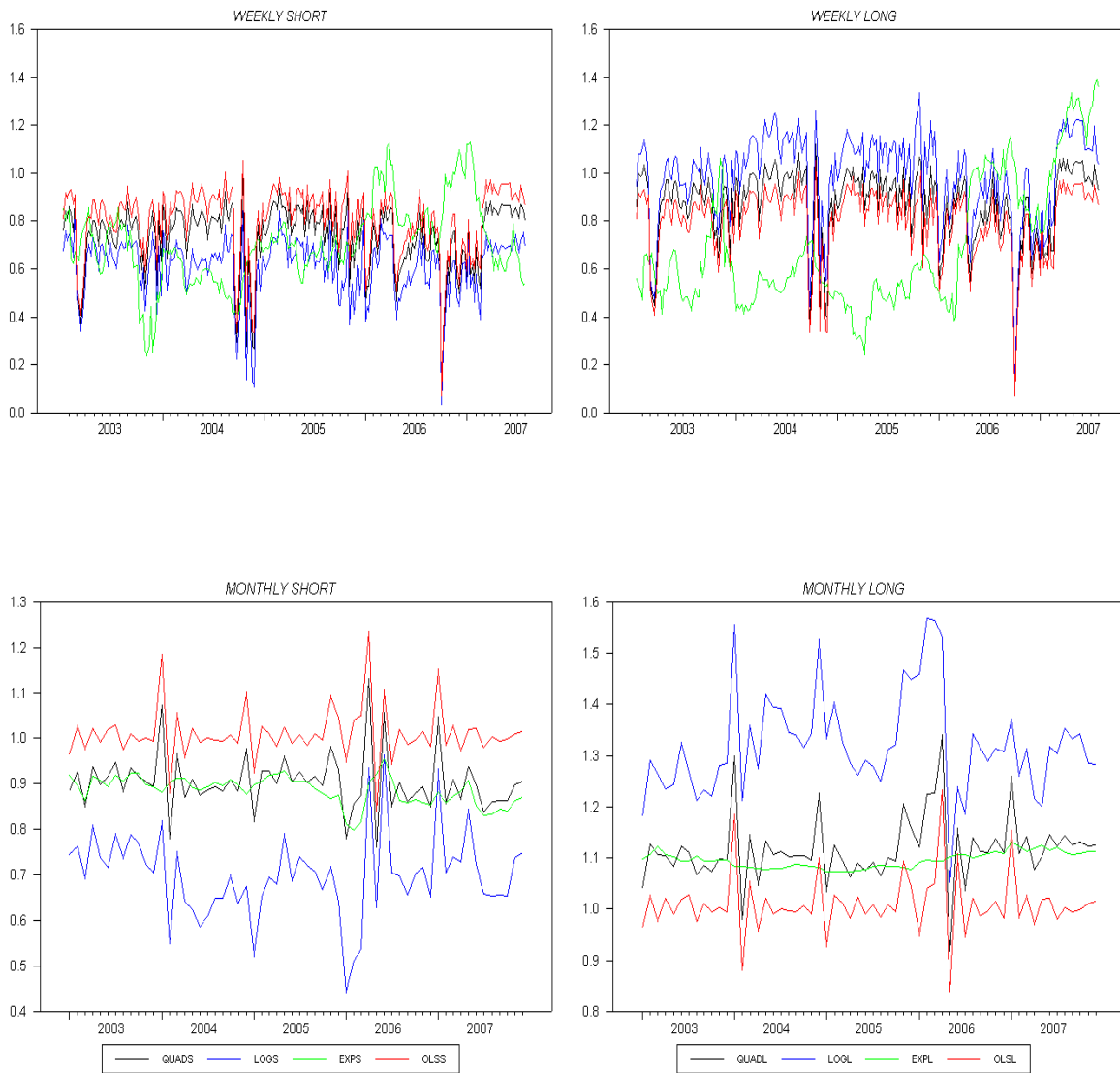
Fig 2a: Time-varying Optimal Hedge Ratios for the Natural Gas contract

This figure is a time-series plot of the OHR's for the in-sample period for each of the different utility functions, Quadratic, Log, and Exponential together with the MVHR OHR for both short and long hedgers for both weekly and monthly hedging frequencies. The variance covariance matrix is calculated using a rolling window to allow each of the hedge strategies to vary over time. This allows us to compare hedges on the basis of utility as the variance covariance matrix underlying the optimal hedges is the same for each utility.