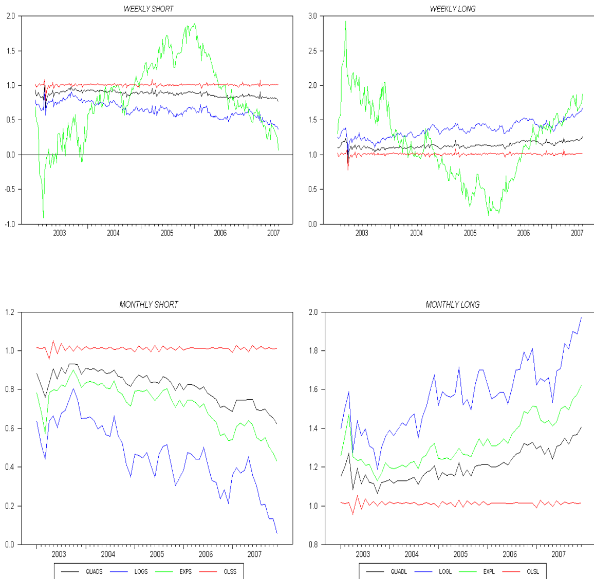
Fig 2b: Time-varying Optimal Hedge Ratios for the Oil contract

This figure is a time-series plot of the OHR's for the in-sample period for each of the different utility functions, Quadratic, Log, and Exponential together with the MVHR OHR for both short and long hedgers for both weekly and monthly hedging frequencies. The variance covariance matrix is calculated using a rolling window to allow each of the hedge strategies to vary over time. This allows us to compare hedges on the basis of utility as the variance covariance matrix underlying the optimal hedges is the same for each utility.