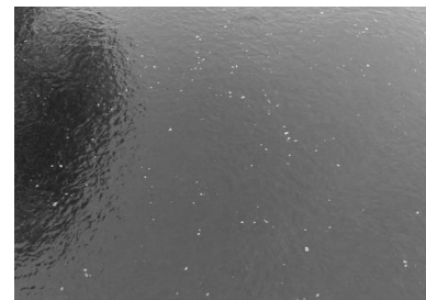
Figure 3. Suds on the River Liffey in Newbridge, Ireland.

Figure 3 shows small amounts of suds floating on the River Liffey at Newbridge in Ireland. At the time of writing and for more than six months, existing regulatory policies and procedures had failed to deal with this environmental pollution. This is a microcosm of the regulatory issue with regard to the Earth as a whole. It has been reported that in the United Kingdom radioactive substances seeped into the ground under the Bradwell nuclear power station in Essex for twenty six years up to 2004 [7]. It has been reported that the nuclear power plant at Tricastin in France lost 75 kg of untreated liquid uranium into local rivers in July 2008 [8]. In the three examples mentioned, the responsible regulatory authorities were relatively local and, it would seem, were not answerable to adequate higher regulatory authorities that could have ensured the necessary levels of diligence in maintaining appropriate standards. It should not be assumed that the exploitation of so-called alternative or green energy sources is any less in need of proper diligence and regulation. Energy in a concentrated form is always dangerous and meeting the needs of what is now, relatively speaking, a very concentrated population on the