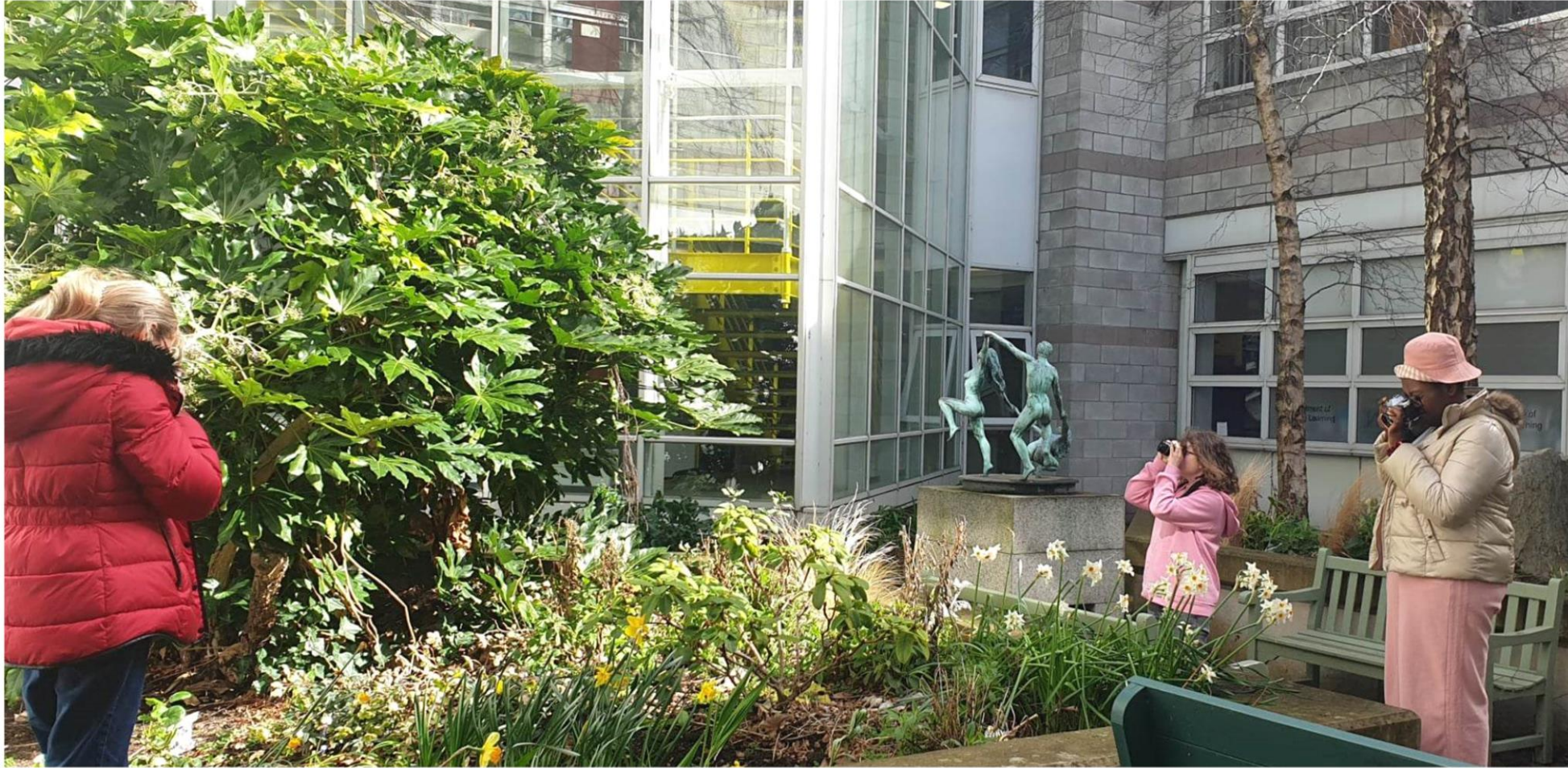
Photography students getting the benefit of the colours, textures and light in the Library Garden.