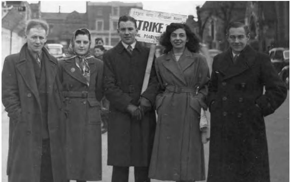
Photo of striking workers during the 1951 strike.