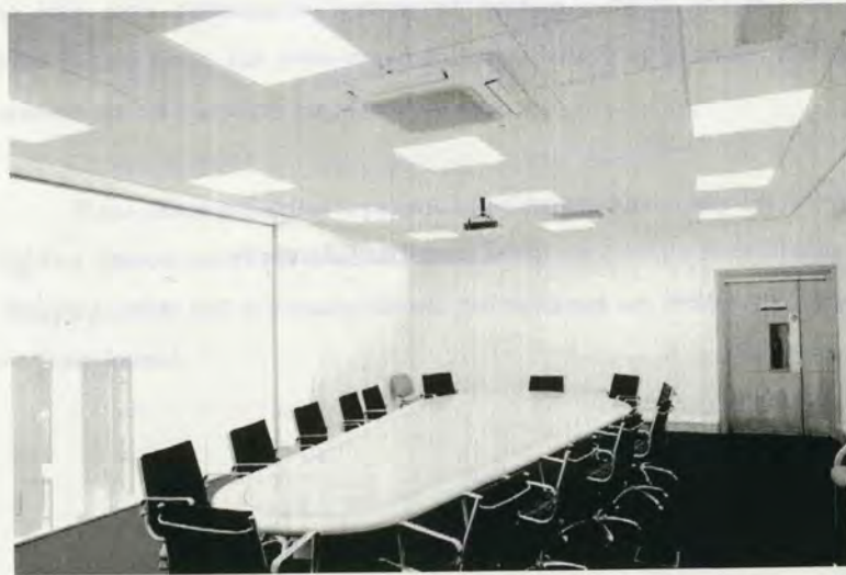
Figure 2-a Building A - Office with Significant Natural Light

Energy consumption and greenhouse emissions are problems on a global scale; however, increasing energy costs are the key drivers forcing business and developers to consider means of possible savings. It has been recognised that artificial lighting may not always be required at full output as had come to be standard practise.