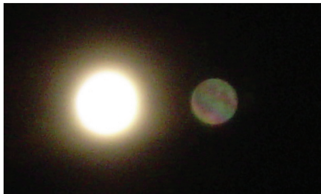
Fig 2. Full Moon photographed through double-glazed window. The secondary image on the right shows the white light interference fringes.