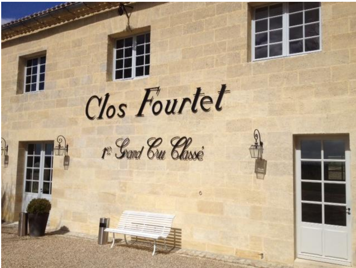
Chateau Clos Fourtet©Copyright

Chateau La Gaffeliere - "Difficult" is a word that stands out in my notes. It is extremely extracted. This has given the wine an almost bitter hawthorn and sloe berry taste. There are touches of green fruit in there also. The oak has given it coffee notes. Where are the ripe sweet fruit flavours and velvety tannins? The finish is long and I suspect the wine will come around with aging. A gamble.