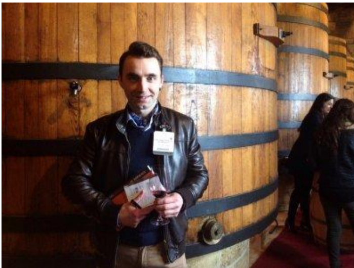
Chateau de Lamarque ©Copyright

Chateau La Tour de By - Mineral driven and expressive. Loads of good Cabernet fruit and earthiness coming through. They have done a good job here.