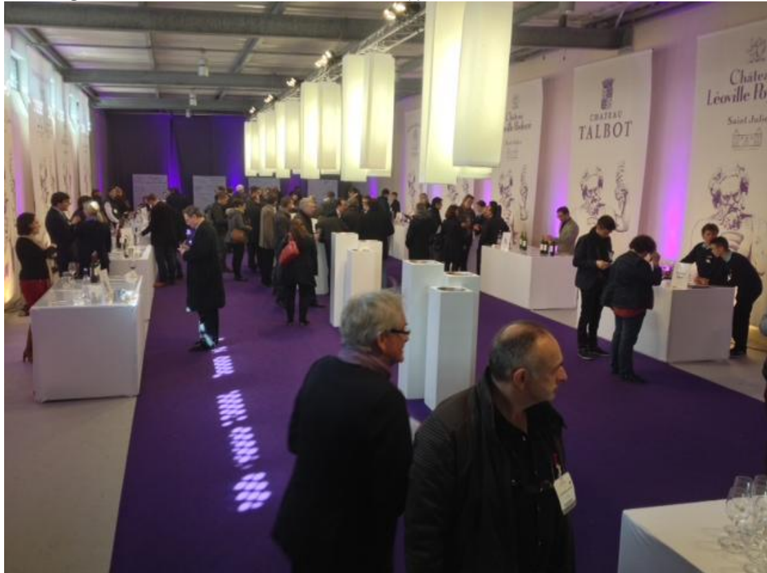
Leoville Poyferre

The tasting was held at Chateau Leoville Poyferre