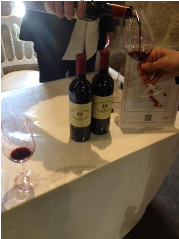
The Pour with Pavie Macquin

Chateau Villemaurine - Oak on the nose. The palate has a round creamy texture with warming spices. Pleasant.